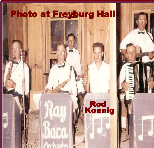
Photo at Freyburg Hall